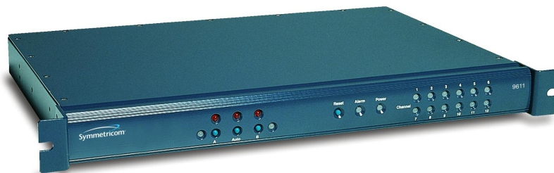
9611 Switch & Distribution Unit

This universal and highly versatile instrument is unequalled in the industry. No other low cost system offers these capabilities in a single product.